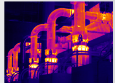
MultiSharp™ Focus produces an image focused throughout the field of view